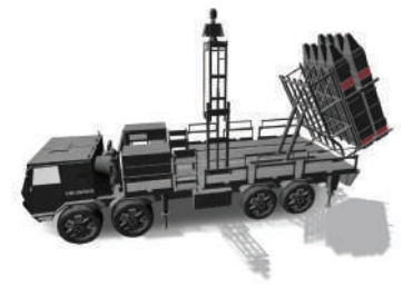
SPYDER MFU-AIO SR/ER